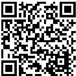
SCAN QR FOR PRODUCT PAGE